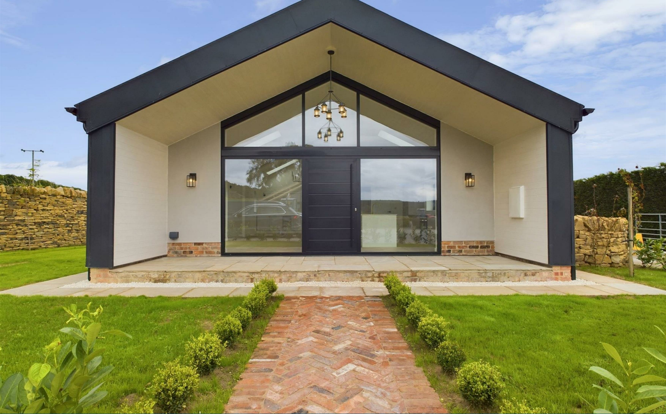
Hillside House Andrew Carr Farm, Oughtibridge, Sheffield, S35 8QD